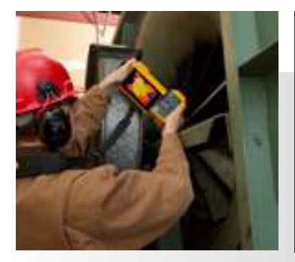
Get tough shots from any angle with a 180° degree rotating lens and the only 5.7 inch LCD.

<sup>1</sup>Compared to industrial handheld infrared cameras with 320x240 detector resolution as of September 1, 2015. <sup>2</sup>Up to 30 meters (100 feet). <sup>3</sup>Compared to a 3.5 inch screen.