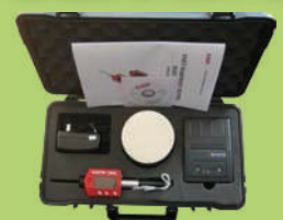
Standard package - HARTIP1800